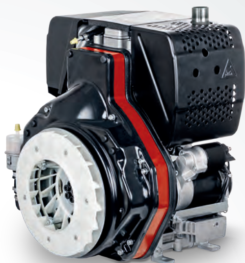
fiPMG with horizontal shaft engine