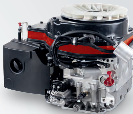
All fiPMG models with 1B30E (horizontal shaft engines) are also available with vertical shaft engines (1B30VE).