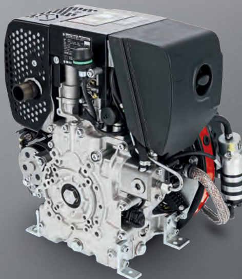
fiPMG with 1B30E engine