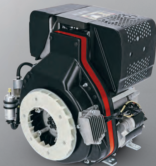
fiPMG with 1B50E engine